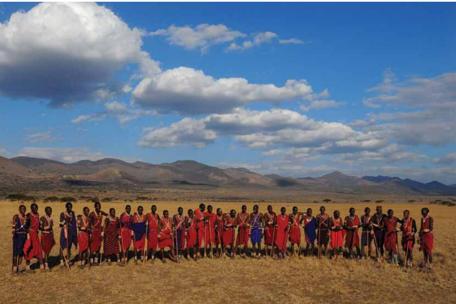
BELOW The 2011 complement of Lion Guardians. The programme has been lauded by a number of leading scientists and indications are that it is having a positive impact on the fortunes of the lions who live within the Amboseli ecosystem.