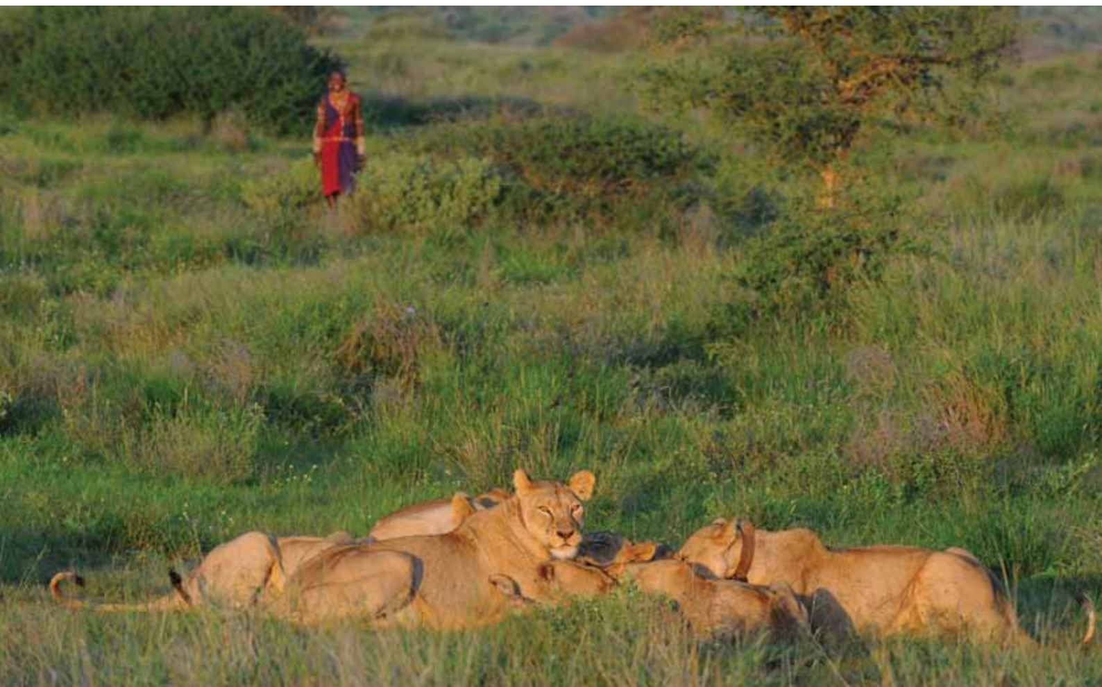
PREVIOUS SPREAD Lenkina Ngida searches for collared lions on Lemomo Hill in front of Kilimanjaro.